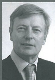
Lord Nash Parliamentary Under Secretary of State for Schools